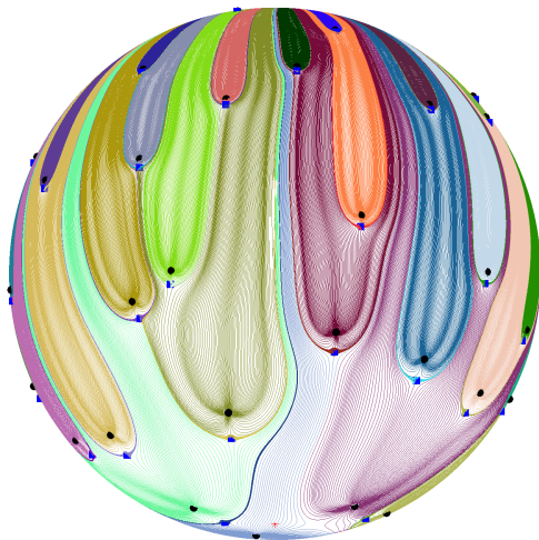
Figure: Zeros – black discs. Crits – blue squares.